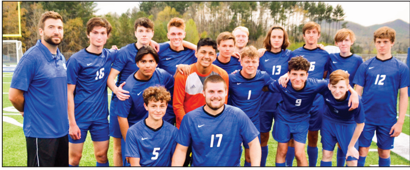
Congratulations to the Towns County Indians for being Region Champs! Pictured here following their April 13 title-clinching game at home against Social Circle.

Friday's win over Washington-Wilkes gives the Towns County defense four shutouts on the year as they enter the Class A Public State Tournament outscoring the opposition by a 60-14 clip in 2021.