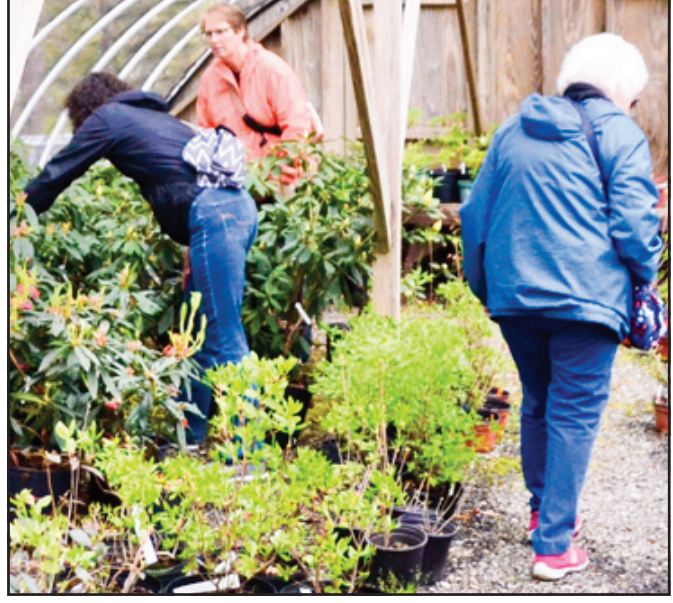
The Hamilton Gardens greenhouse was the base of operations for the organization's giant plant sale April 17, coinciding with the annual "A Blooming Affair."

The affair and sale are always well supported by people from all over, and